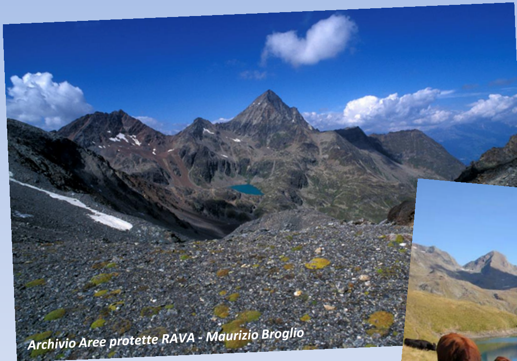
Archivio Aree protette RAVA - Maurizio Broglio