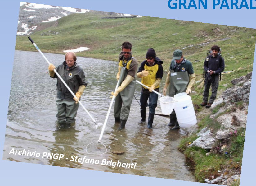
Archivio PNGP - Stefano Brighenti